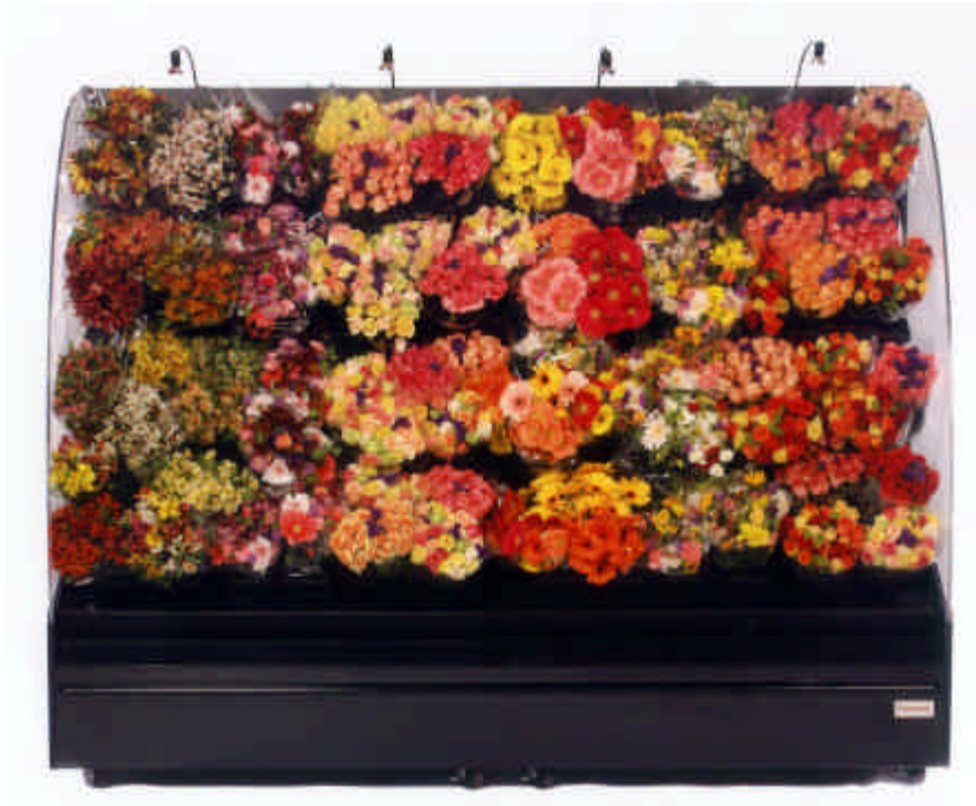
Shown above, 8-foot unit with optional halogen lights and glass grille.

The Wall of Color is an industry first in tall, open refrigerated floral cases, featuring Floritech's patented boundary layer airflow technology. The cooler has a large floral capacity with a unique shelving system to optimize floral presentations. It is available in 4-5-6-8 foot modules.